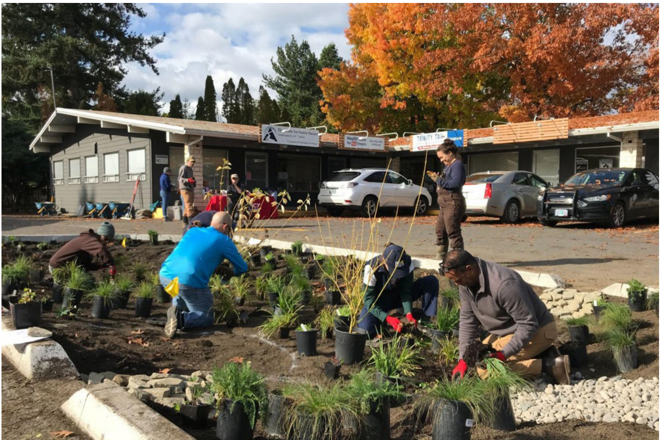
Once half-vacant, Plaza 122 is now 90% leased and an economic center within East Portland.

Table 1 details the typical capital stack that CIT puts together to finance property acquisition and development and how each source of funds is deployed.